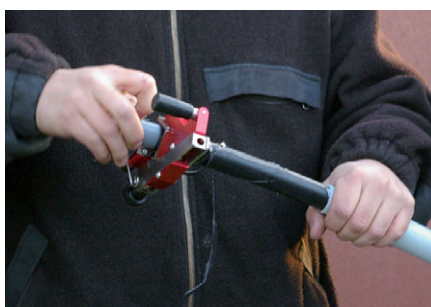
FBS1722, for stripping of outer conductive layer gives a very smooth result.

For preparation and stripping of medium voltage conductors, 12-24kV, tools FBS1722 and 1723 are used. FBS1722 strips (Ø10-50 mm) outer conductor screen of XLPE conductors and FBS1723 strips (Ø15-52 mm) PEX insulation on intermediate voltage conductors.