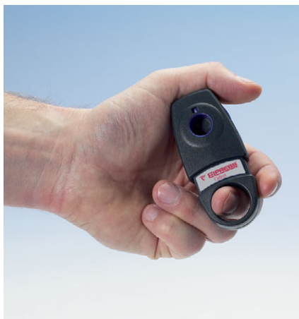
ODEN, precise setting for the different insulations is easily made by means of the nine position setting wheel.

The precise stripping tool ODEN, strips cables Ø2,5-11 mm, is used for stripping of the outer layer for signal cables and the like.