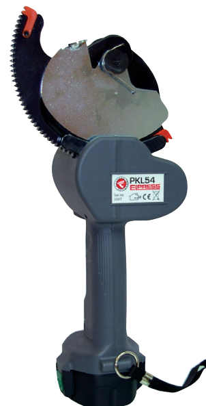
PKL54, cutting tool.

Elpress cutting tools are available in several variants for cutting of Cu and Al conductors, up to a diameter of Ø85 mm. Apart from the mechanical cutting tools that cut cables up to Ø20 mm, there is a wide range of hydraulic cutting tools which cuts cables up to Ø85 mm. The electrical cutting tool PKL54 is easy to operate and the protective cap gives high safety for the user. The tool has a preferable scissor action while cutting and cut conductors up to Ø54 mm.