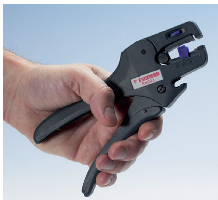
EMBLA, ergonomically designed cutting- and stripping tool.

Elpress stripping tool EMBLA is a self-adjusting cutting and stripping tool for modern electrical installation. The tool strips a wide range of insulations from PVC to PTFE and takes 0.02-10 mm 2 with just one tool. The ergonomic design of the tool has result in a lightweight but strong and comfortable tool equally qualified for high volume production and portable/field usage.