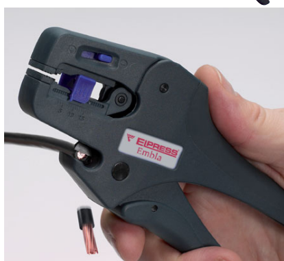
EMBLA, ergonomically designed cutting- and stripping tool.