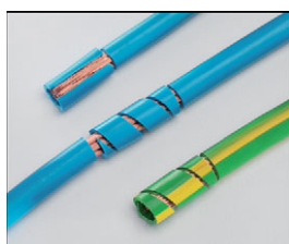
Three stripping functions.