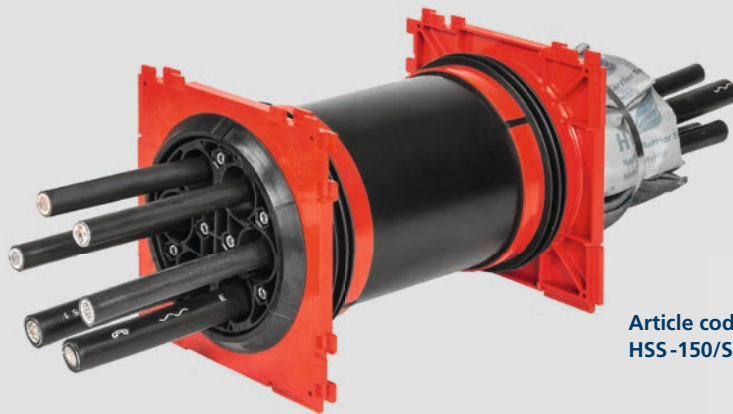
Article code: HSS-150/SEG/D/DG

DIBT approval Z-19.15-1906 to DIN 4102-9